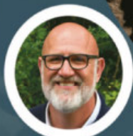
Speaker Elvis Grbac Former NFL Superbowl Champion